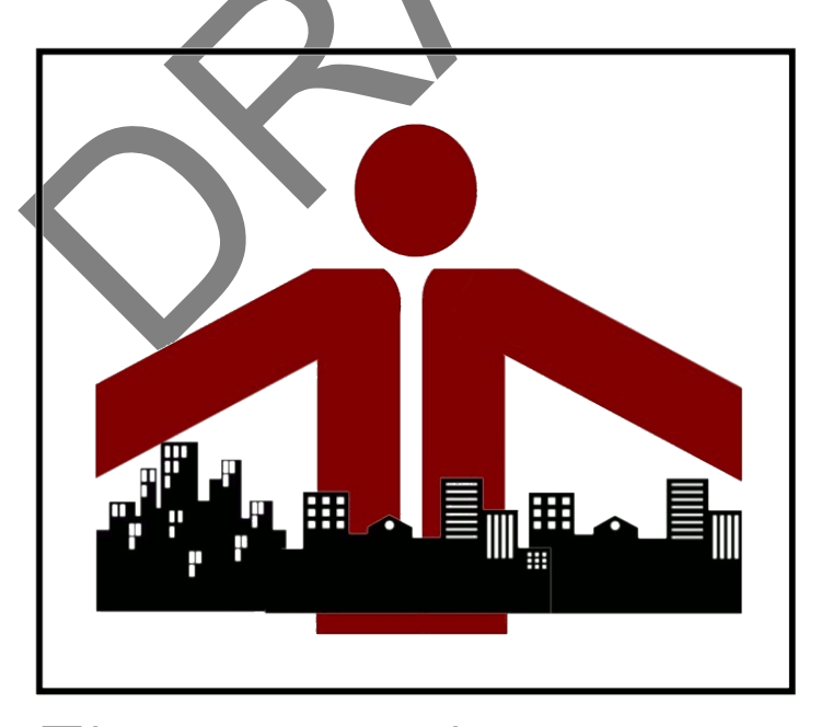
Fire Underwriters Survey